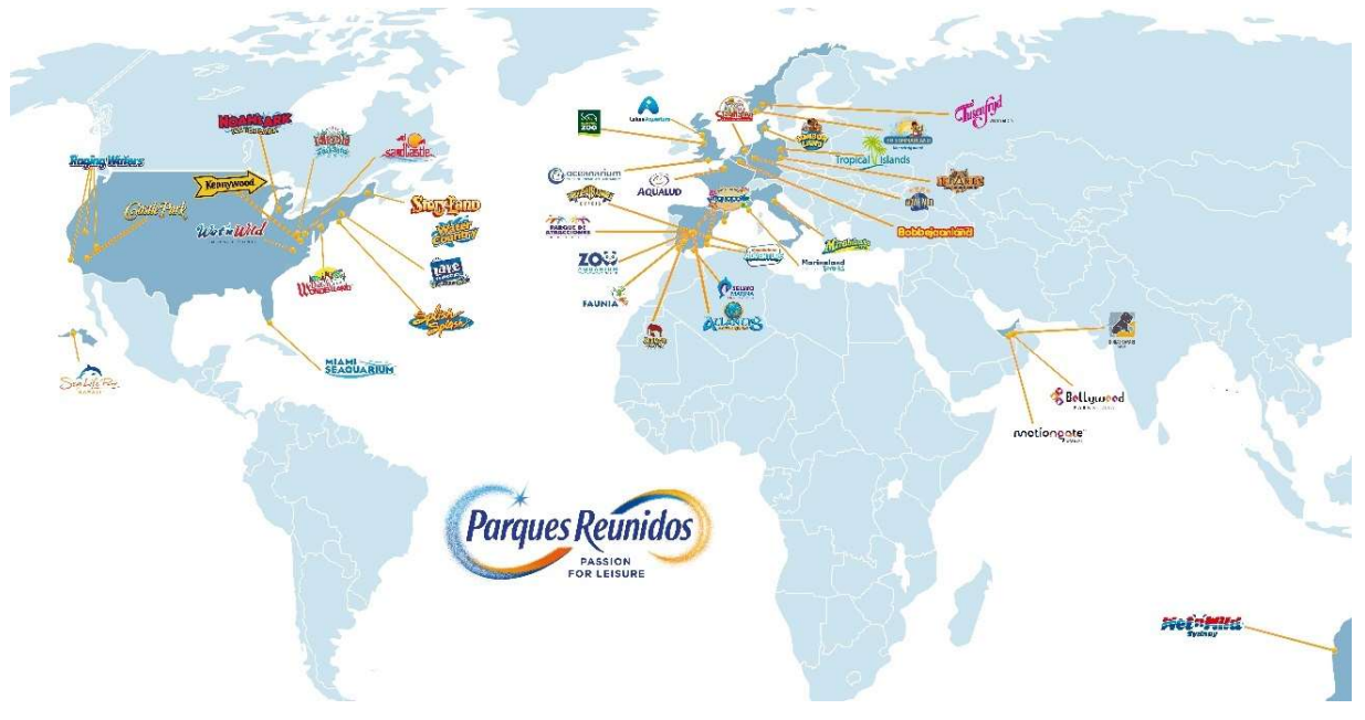
Figure 1. Locations of the Group's parks

It currently manages a diversified portfolio of over 60 leisure parks in 12 countries in Europe, the Americas, Oceania and Middle East. The next diagram shows the locations of the Group's parks.